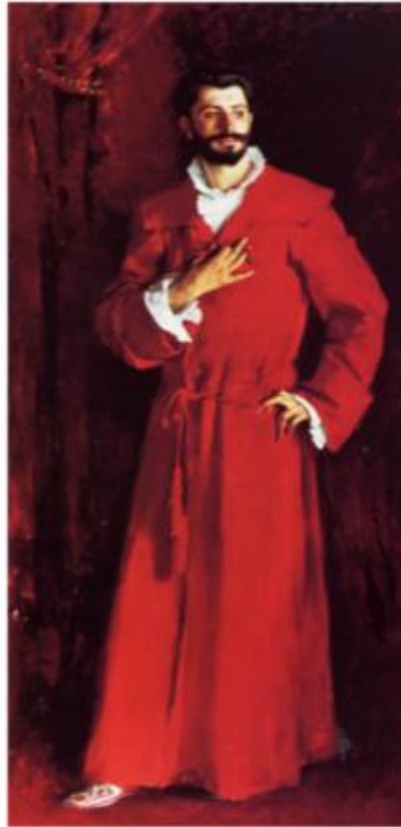
Dr. Pozzi at Home, 1881 John Singer Sargent