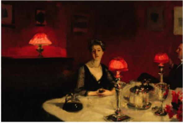
A Dinner Table at Night, 1884