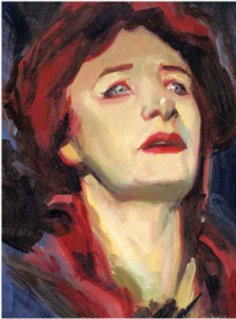
Study for Lady Macbeth

Task 1 - (There are more Singer Sargent portraits on the internet also)