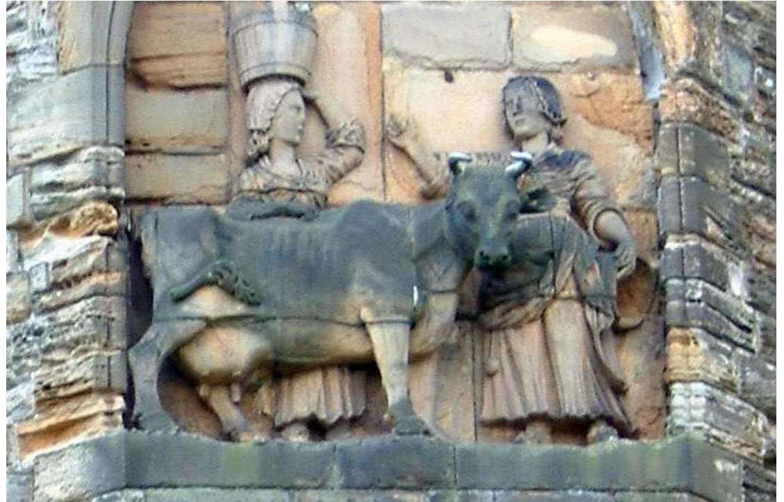
The story of the Dun Cow, as depicted in an eighteenth-century panel on the north facade of Durham Cathedral.

The puzzled monks stood perplexed at how to find 'Dunholme'. Then a cow girl walked by, and asked another young woman if she had seen a lost dun (brown) cow. The young woman said she had seen the cow heading in the direction of Dunholme – and pointed out the way. The monks, who had overheard this exchange, decided to follow the cow-girl, and found that St Cuthbert's coffin moved readily in that direction. They continued along that road and got to Dunholme (Durham).