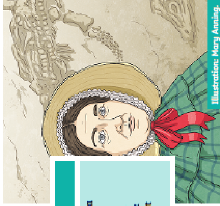
Illustration: Mary Anning.